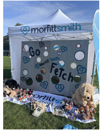
Morfitt Smith our event sponsors

The rings showcased the talents and charm of our four-legged companions, with categories ranging from Best Rescue to Dog Most Like its Owner. Dogs of all shapes and sizes strutted their stuff, leaving the audience in awe of their agility, obedience, and, of course, undeniable cuteness.