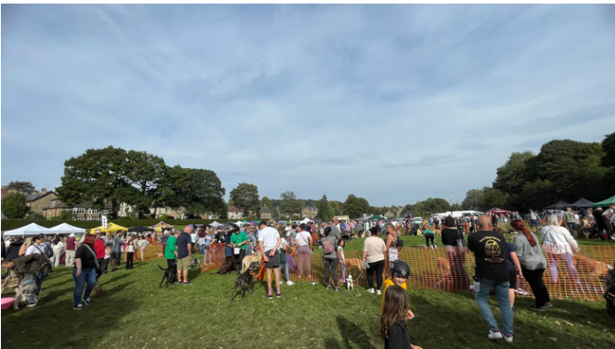
Pooches In The Park 2023